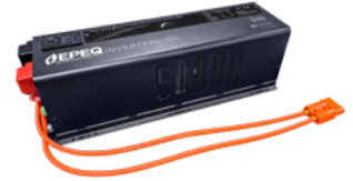
EPEQ® INVERTER6000 48V, 120VAC/240VAC, 6kW Low Frequency