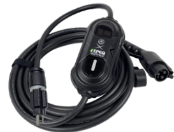
EPEQ® Level 1 Charger