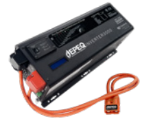
EPEQ® INVERTER3000 48V, 120VAC/240VAC, 3kW Low Frequency