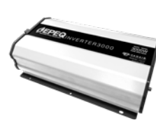
EPEQ® INVERTER3000 48V, 120VAC, 3kW High Frequency

The EPEQ® 48V AC Power Inverter lineup includes four Pure Sine Wave inverters to fit any need. The EPEQ® INVERTER3000 provides both a high frequency 120V or a low frequency 120VAC/240VAC, while the high frequency INVERTER5000 provides 240VAC. The uniqueness of the EPEQ® 5kW inverter is that it is stackable to achieve 10kW, 240VAC power. The low frequency EPEQ® INVERTER6000 provides 120VAC/240VAC power with 300% surge output.