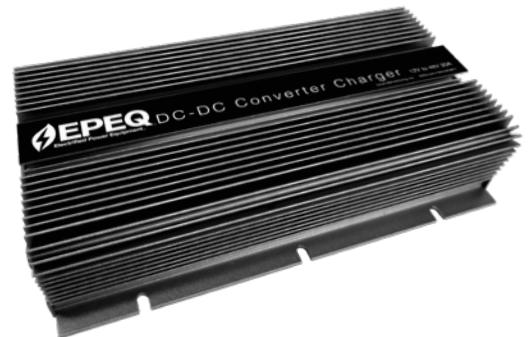
EPEQ® DC-DC CONVERTER 12V to 48V, 20A

12V input to 48V output to charge the ELiMENT® Battery, available in 20A output. Recharges the battery back while driving.