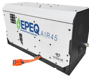
EPEQ® AIR45 30-45 CFM @ 150 PSI Rotary screw compressor ideal for air on demand applications