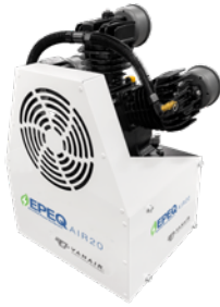
EPEQ® AIR20 20 CFM @ 150 PSI Reciprocating compressor ideal for intermittent air use

EPEQ® Air Compressors are driven by highly tuned and specialized permanent magnet AC (PMAC) electric motors for increased efficiency to prolong battery range. The EPEQ® AIR20 and AIR45 compressors communicate with the EPEQ® Smart Display and are designed to provide optimal performance.