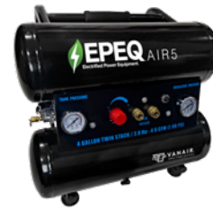
EPEQ® AIR5 4-5 CFM @ 125 PSI Cast iron, oil-free compressor ideal for intermittent air use with small air tools