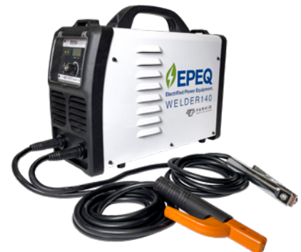
EPEQ® WELDER140 CC Stick Welding, 140A

The Vanair® EPEQ® WELDER140 combines the flexibility of lithium-powered welding with Vanair's long history of providing top-level welding capabilities. The ability to carry the entire welder and cables (34 lbs. total weight) right next to the equipment being worked on, makes the EPEQ® WELDER140 extremely user-friendly for those fast repair jobs.