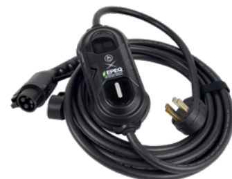
EPEQ® Level 2 Charger