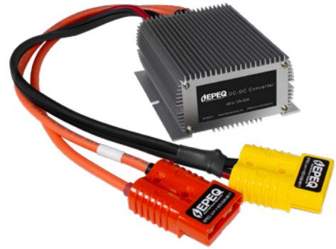
EPEQ® DC-DC CONVERTER 48V to 12V, 60A

Provides 60A of power when the vehicle is off to run all your 12V accessories, such as emergency lighting and flashers.