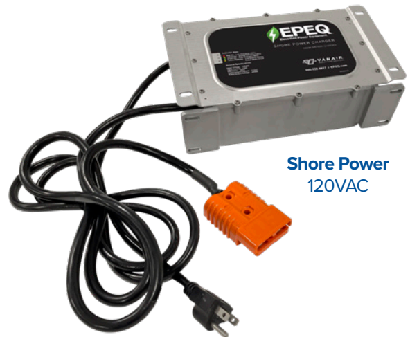
Shore Power 120VAC

EPEQ® Shore Power provides 120VAC to charge your ELiMENT® Battery. The Shore Power charger utilizes, but does not provide, 120VAC to charge the battery.