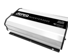
EPEQ® INVERTER3000 48V, 120VAC, 3kW High Frequency

The EPEQ® 48V AC Power Inverter lineup includes four Pure Sine Wave inverters to fit any need. The EPEQ® INVERTER3000 provides both a high frequency 120V or a low frequency 120VAC/240VAC, while the high frequency INVERTER5000 provides 240VAC. The uniqueness of the EPEQ® 5kW inverter is that it is stackable to achieve 10kW, 240VAC power. The low frequency EPEQ® INVERTER6000 provides 120VAC/240VAC power with 300% surge output.