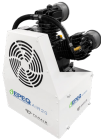
EPEQ® AIR20 20 CFM @ 150 PSI Reciprocating compressor ideal for intermittent air use

EPEQ® Air Compressors are driven by highly tuned and specialized permanent magnet AC (PMAC) electric motors for increased efficiency to prolong battery range. The EPEQ® AIR20 and AIR45 compressors communicate with the EPEQ® Smart Display and are designed to provide optimal performance.