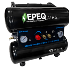
EPEQ® AIR5 4-5 CFM @ 125 PSI Cast iron, oil-free compressor ideal for intermittent air use with small air tools