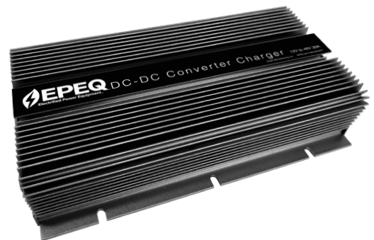
EPEQ® DC-DC CONVERTER 12V to 48V, 20A

12V input to 48V output to charge the ELiMENT® Battery, available in 20A output. Recharges the battery back while driving.