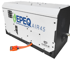
EPEQ® AIR45 30-45 CFM @ 150 PSI Rotary screw compressor ideal for air on demand applications