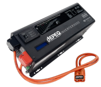
EPEQ® INVERTER3000 48V, 120VAC/240VAC, 3kW Low Frequency