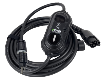
EPEQ® Level 1 Charger