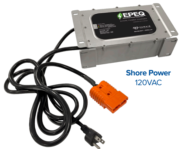
Shore Power 120VAC

EPEQ® Shore Power provides 120VAC to charge your ELiMENT® Battery. The Shore Power charger utilizes, but does not provide, 120VAC to charge the battery.