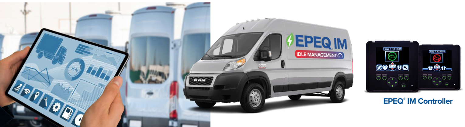
EPEQ® IM Controller

EPEQ® IM by Vanair® is a patented vehicle control system that autonomously manages fleet idling, energy consumption, and climate-control so your operators can do their job safely and effectively.