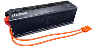
EPEQ® INVERTER6000 48V, 120VAC/240VAC, 6kW Low Frequency